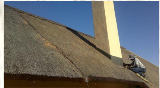
Photo clearly showing how the thatch is raised after servicing.

Looking at the photo above one can see top left part of the roof already serviced, the middle part still needing to be serviced and the bottom area with layers pulled back.