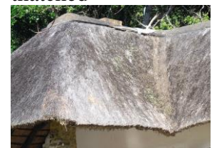
A corner very thinly thatched

Solution: The corners of the roof need to be stripped and re-thatched. If you are in a high wind area hex-net can also be applied to the corner of the roof to prevent the wind from buffeting the thatch. This general problem is easily prevented by using an experienced thatching contractor.