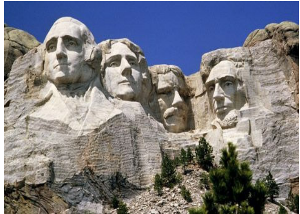
What it looks like from the American side