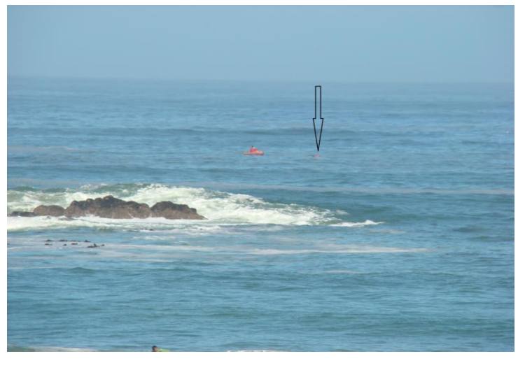
Besides the boat she was just a dot in the ocean. Holding back for the Robben Island ferry to pass.