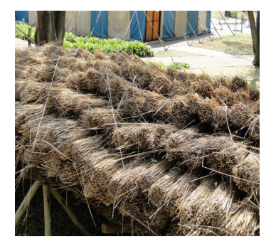
The difference in quality of thatch grass