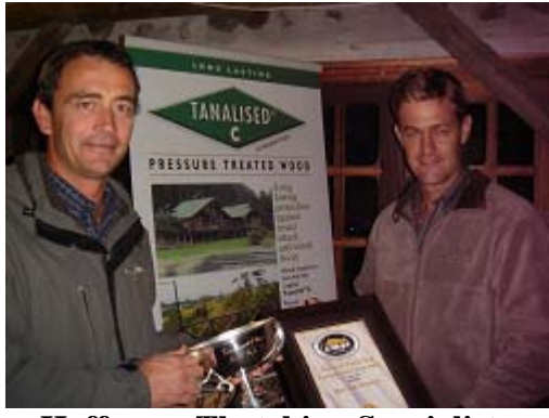
Hoffmans Thatching Specialists WINNER: BEST POLE STRUCTURE