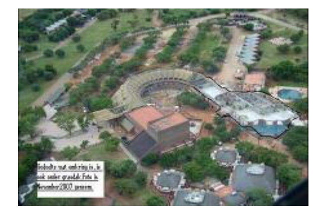
Protea Hotels: Nkolo Spa (Floor surface: 4 838 sq m) (Roof surface: 7 257 sq m)