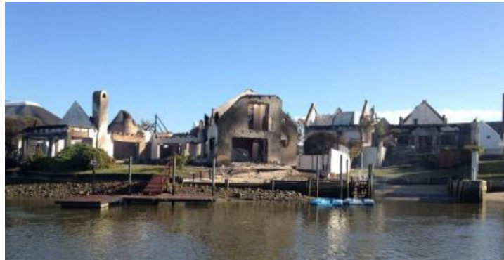
Thatch roof development in St Francis Bay