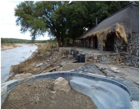
Flood damage in Limpopo

The new year being in full swing started off badly unfortunately with severe flood damage in various provinces. TASA sympathises with everyone affected as well as those involved in the fires that raged in St Francis Bay towards the end of last year.